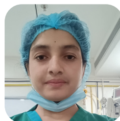
Emergency Medical Technician, V One Hospital, Indore

Born & brought up in the hills of Kalimpong, she is now employed in Bangalore.