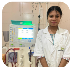
Dialysis Technician Apollo Dialysis Clinics