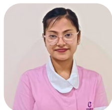
General Duty Assistant Cloud Nine Hospital, Bangalore