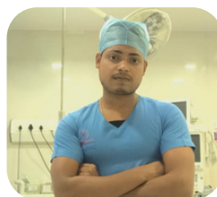
Emergency Medical Technician Cloud Nine Hospitals

From humble beginning to a healthcare professional at a leading Dialysis service provider.